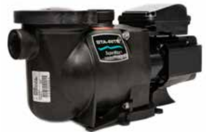
SuperMax High Performance Pump

Known for high performance, energy smarts, easy upkeep, and proven reliability.